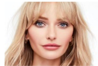
Model has deep-set eyes and square-shaped face.

Want a simple trick for a slimmer-looking nose? Brush highlighter down the bridge of your nose, and apply contour on either side for dimension. Easy as that!